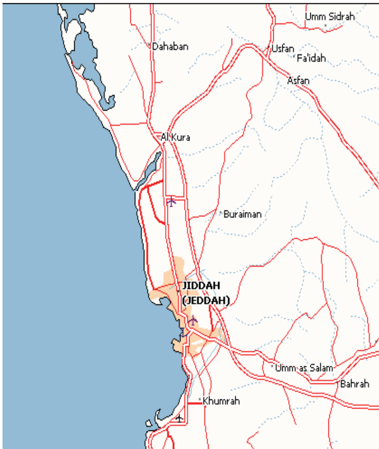
Fig. 1. Location map.

results in excess evaporation as high as 205 cm/yr. Such an intensive evaporation in conjunction with sparse river discharges into the sea, results in high surface salinity (36 and 38 ‰) making Red Sea as one of the most saline water bodies in the world. The watermass so formed, subsequently drives the thermohaline circulation of Red Sea thereby transporting the surface water to subsurface and is discharged to Arabian Sea where it ventilates the land-locked Arabian Sea at around 900 to 1000 m and plays a vital role in geochemical processes. In general tide ranges between 0.6 m in the north, near the mouth of the Gulf of Suez and 0.9 m in the south near the Gulf of Aden but it fluctuates between 0.20 and 0.30 m away from the nodal point. The central Red Sea (Jeddah area) is almost tideless.