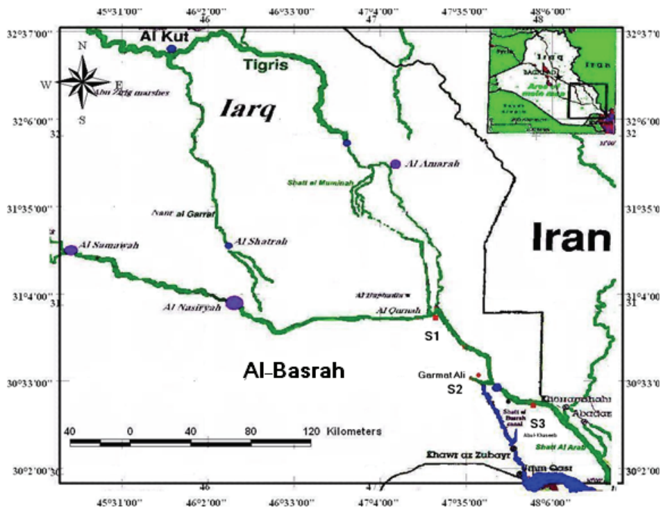
Fig. 1. Sampling sites on Iraqi map.

The sampling locations are illustrated on the Iraqi map (Fig. 1).