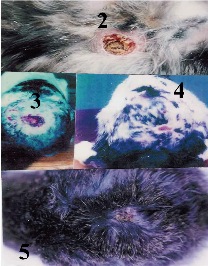
Plate 1. Showing burned skin of rabbits after topical application of treatments, 2: Untreated burned skin, 3 and 4: Treated burned skin by antibiotic Baneocin - Zinc and 5: Treated burned skin by NSO.

some hair roots were also grown. At the end of experiment, the burnwounds which were treated by both antibiotic and oil of NSO slightly restored their normal architectures.